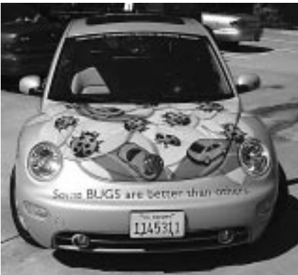
The very cool "bug"