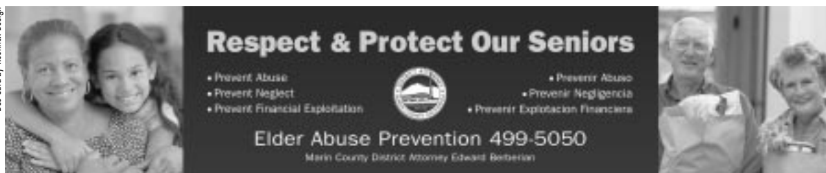
Bus Card by Roehrick Design