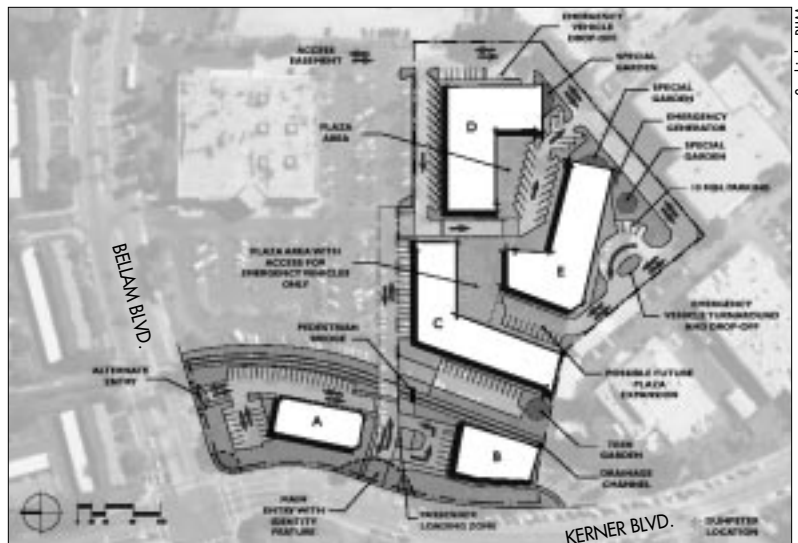
Health and Wellness Campus