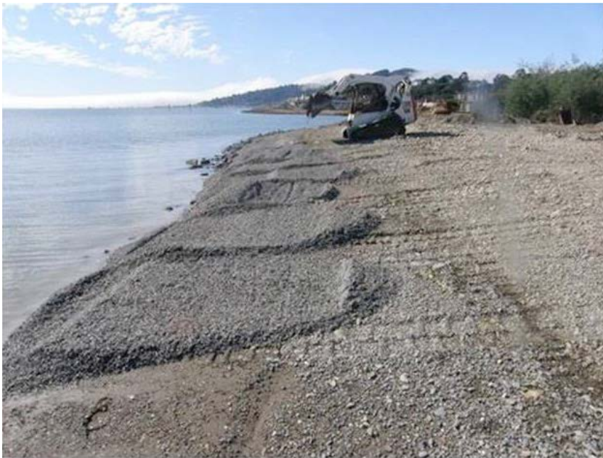
Figure 2: Placing gravel along Aramburu Island shoreline.

Visual observations and site surveys show that the project has been successful in halting extensive shoreline erosion and is self-adjusting its elevation. Surveys of the constructed beach before and after storms are documenting changes to the bay beach so that the usefulness of constructed coarse-grained beaches as an approach to sea level rise adaptation and habitat benefits can be evaluated and promoted.