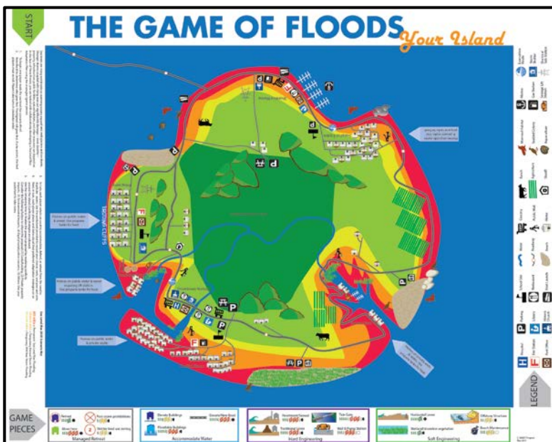
Figure 1: The Game of Floods game board

One such innovative approach to education and engagement is the county-developed board game The Game of Floods, which takes place on an island with fictitious communities that have the same real-world sea level rise issues as those in Marin County. The Game of Floods engages community members in learning about applicable sea level rise adaptation techniques they then place around the board. This exercise raises awareness of the different techniques available to Marin County and their accompanying pros, cons, costs, and benefits.