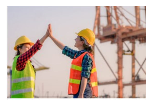
SENIOR CIVIL ENGINEER DEPARTMENT OF PUBLIC WORKS ENGINEERING DIVISION