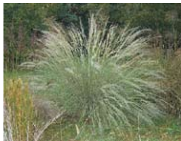
Bluestem Nursery, www.bluestem.ca

This large, dependable, and showy ornamental grass has blue-gray foliage and flowering spikes in the fall and winter. Good in poor soils, it grows up to five feet tall. Works well as a specimen plant or massed into an attractive border.