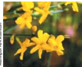
Washington Park Arboretum