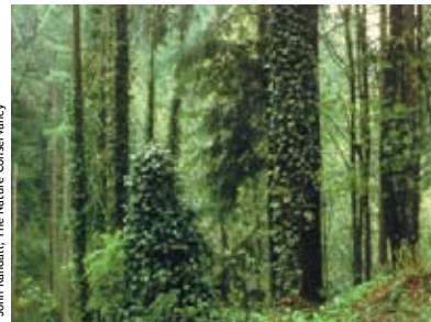
Invasive ivy covers forest understory vegetation

Many of the characteristics that make a plant an attractive choice for the garden may also make it a successful invader: