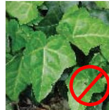
Missouri Botanical Garden

When birds carry the seeds of these popular plants into wildlands, ivies can smother trees and understory plants by completely shading them, which also prevents regeneration of new tree and shrub seedlings. Ivy can harbor pests, such as rats and snails. Researchers hope to determine which ivies can be used safely.