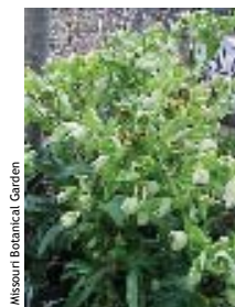
Missouri Botanical Garden