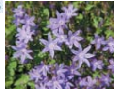
Missouri Botanical Garden

( Campanula poscharskyana ) Produces a profusion of lilac-blue, star-shaped flowers spring to fall. Grows quickly and easily, but could overwhelm a carefully manicured garden.