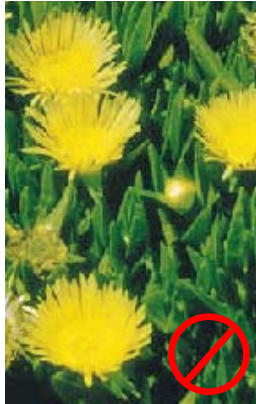
Charles Webber © 1998 California Academy of Sciences

Small mammals can carry seeds of iceplant from landscape settings to nearby coastal dunes and other sensitive areas. The vigorous groundcover forms impenetrable mats that compete directly with native vegetation, including several rare and threatened plants along the coast.