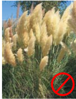
Brianna Richardson, 2003

Though a grass, grows to size of large shrub. Wind can carry the tiny seeds up to 20 miles. The massive size of each pampasgrass plant with its accumulated litter reduces wildlife habitat, limits recreational opportunities in conservation areas, and creates a serious fire hazard.