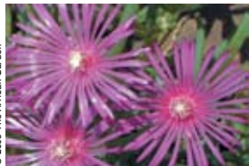
David Fenwick © 2003 The African Garden