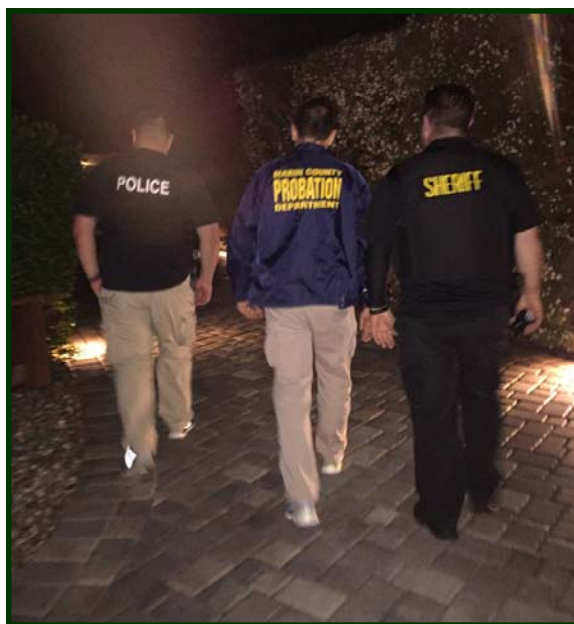
A great example of Police, Probation and Sheriff Collaboration