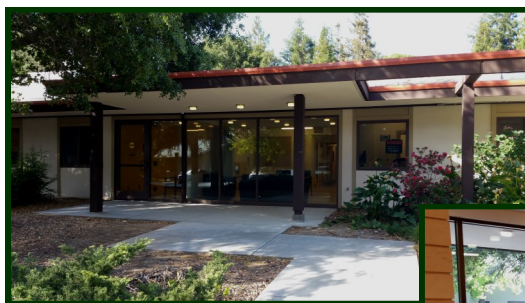
The view of the front entrance to the building.