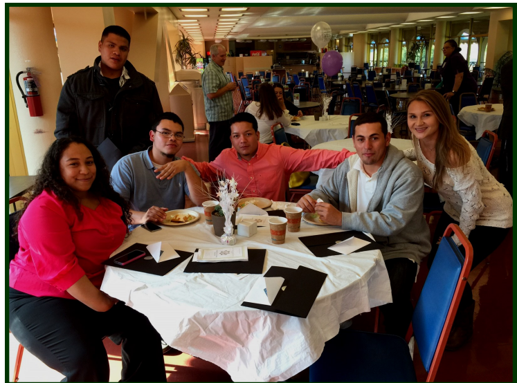
Graduates from the T4C program celebrating their success.