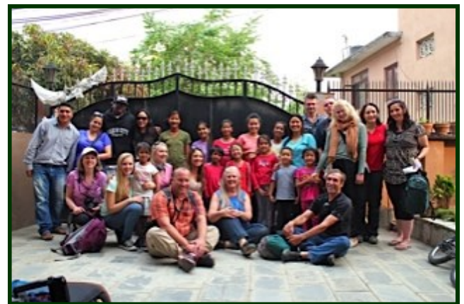
Manang Nepalu Children Organization. Orphanage, Kathmandu, Nepal