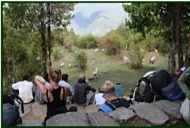
Third day of the trek, on the way to Ghandruk

Please note that a percentage of the money raised during the events will be given to Youth on the Move, an after school enrichment program for Davidson Middle School students, as one of the group's goal is to support the local community as well as those abroad.