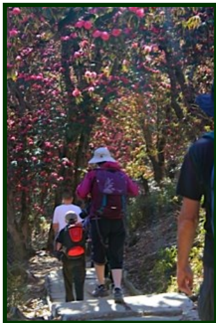
Trekking Annapurna Trail, Nepal