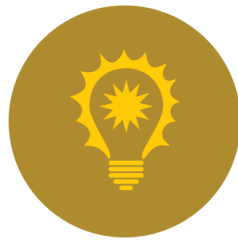
Innovation & Change

At various places in the IST Strategic Plan, you may notice the icons pictured below. These symbols indicate that an item in that section is linked directly to a similar item in the County's 5 Year Business Plan. If you reference the 5 Year Business Plan you will find the same icons and you will see how the two plans are connected.