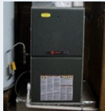
Furnace Upgrade - 96% AFUE Trane Furnace