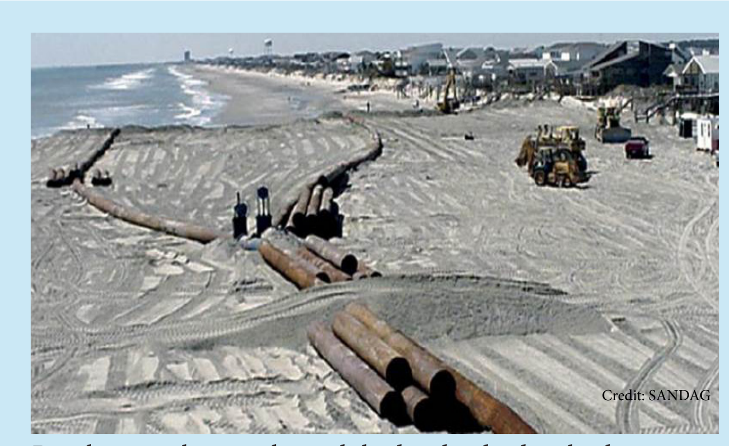
Beach nourishment through hydraulic dredge discharge on beach, spread with land-based construction impact.

The Regional Beach Sand Project placed 1.5 million cubic yards of sand on eight beaches from Imperial Beach to Oceanside