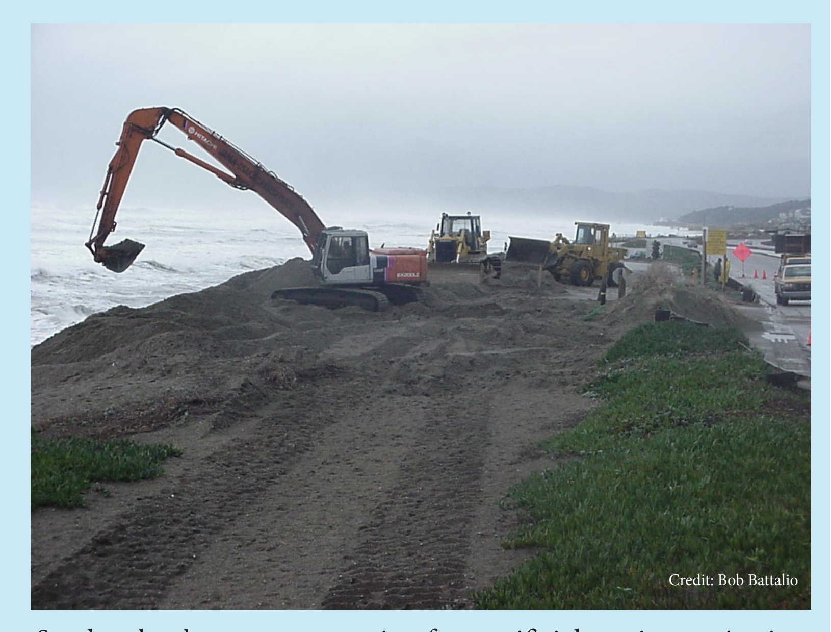
Sand embankment construction for sacrificial erosion projection

• In 2012, Golden Gate National Recreation Area partnered with the SF Public Utilities Commission to truck 73,000 cubic yards of excess sand from the north to south end of Ocean Beach