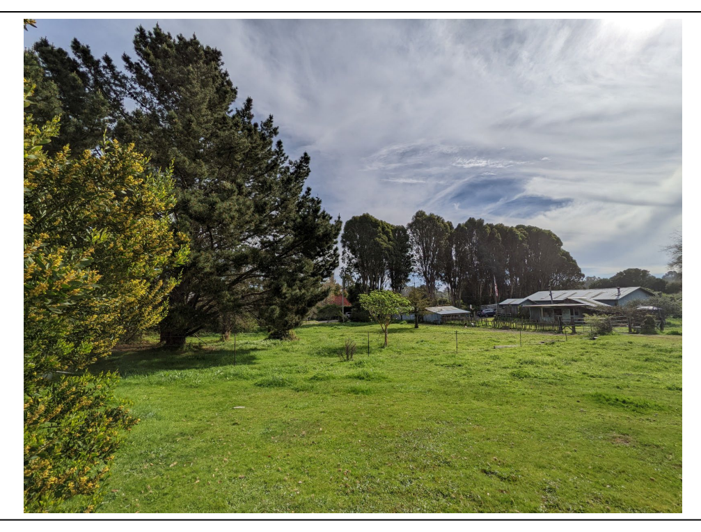
Photo 7. View of the residence in the background facing southwest. Monterey pines and eucalyptus trees visible on the property.