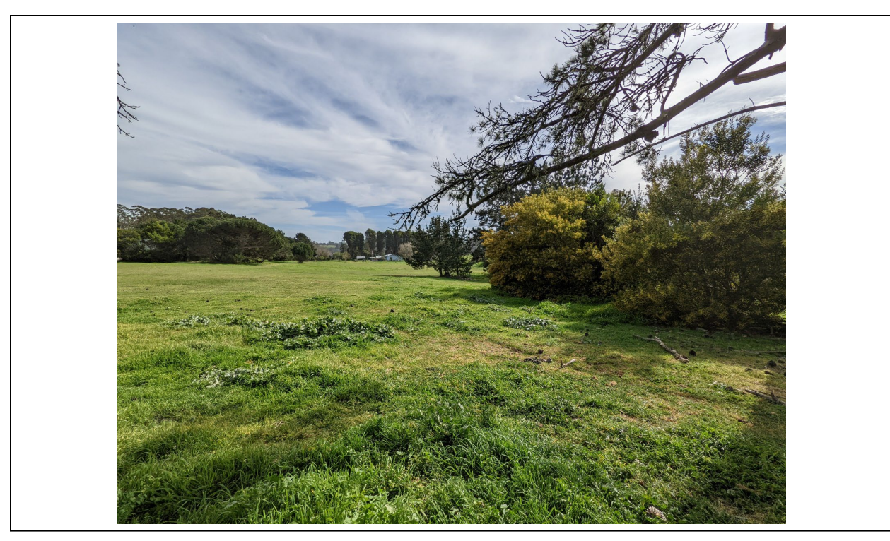
Photo 5. View of the horse pasture with mature trees in the background.