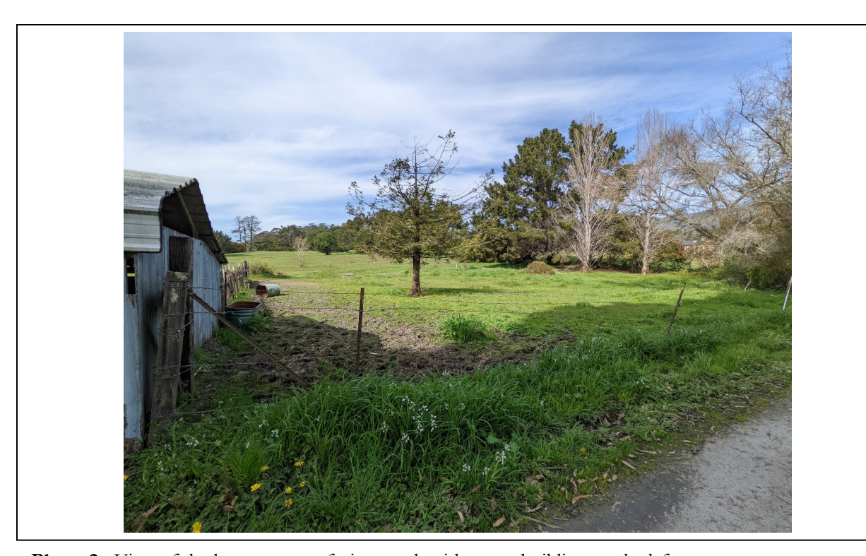
Photo 2. View of the horse pasture facing north with an outbuilding on the left.