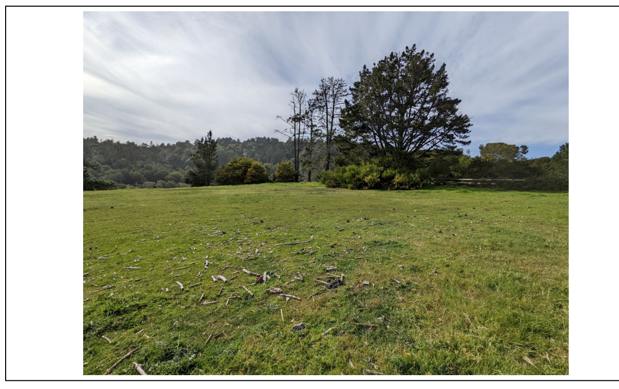
Photo 6. View of the mature Monterey pine tree providing suitable habitat for raptors and migratory birds.