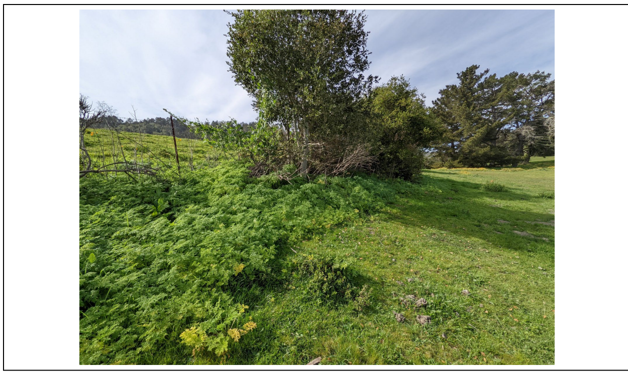
Photo 4. View of the perimeter fence with herbaceous vegetation that is suitable upland foraging and refugia habitat for California red-legged frogs.