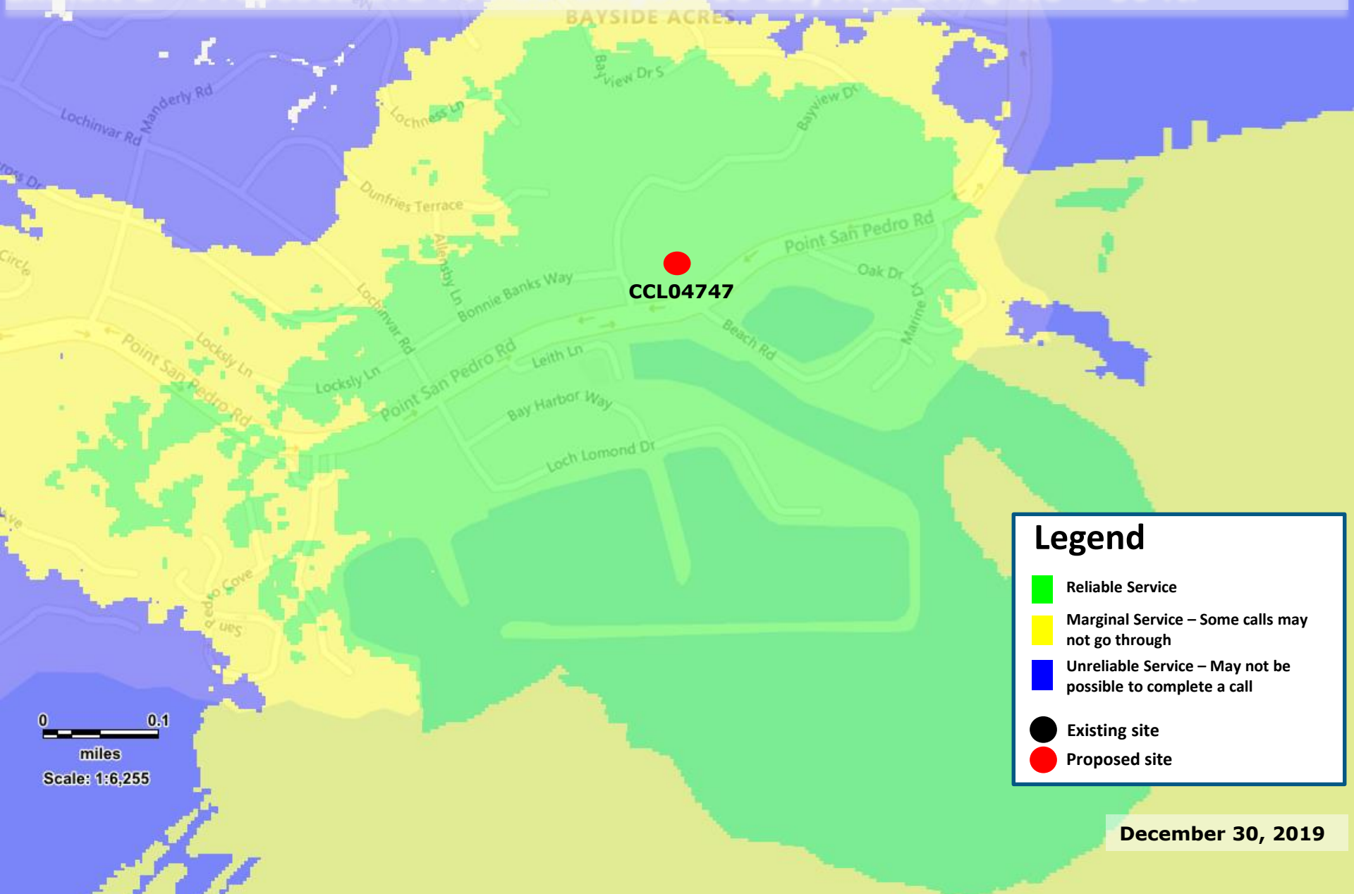
Exhibit 2 – Proposed LTE 700 Coverage – 10 Bayview Dr. @ RC = 30 ft.