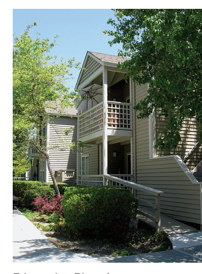
Edgewater Place in Larkspur provides affordable apartments for families, but has long waiting lists.

For Marin workers seeking an affordable rental option costing less than $1,500 per month, the discrepancy between supply and need totals more than 25,000 homes. This is not to suggest that Marin should aim to build 25,000 affordable homes next year. But this does shed light on the scale of the problem, and the limited choices available to Marin employees earning less than $54,000 per year.