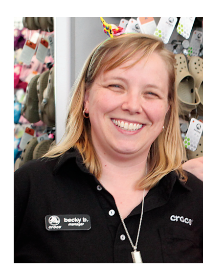
Many retail workers have to commute from Sonoma County.

Marin's struggle to house its workforce is making already bad traffic worse. Between 2004 and 2008, the number of in-commuters rose by 5,500, adding more than 4,600 new cars on a daily basis to Marin freeways and local roads, taking into consideration carpooling and transit use.<sup>9</sup>