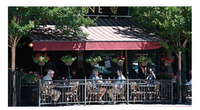
One percent of in-commuters moving to Marin would bring nearly $600,000 in new revenue to restaurants, cafés and bars in Marin each year.

This report shows how new workforce housing can not only help commuters drive less and live closer to where they work, but also be a jobs and economic driver for Marin. It suggests local governments now have a greater incentive to accelerate the development of a blueprint for much-needed housing.