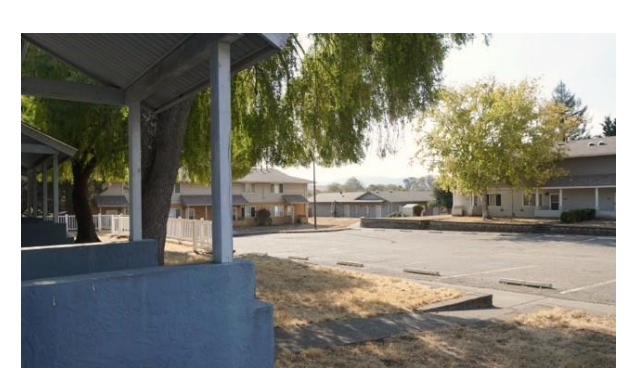
Housing and Federal Grants Division | www.marincounty.org/coastguard