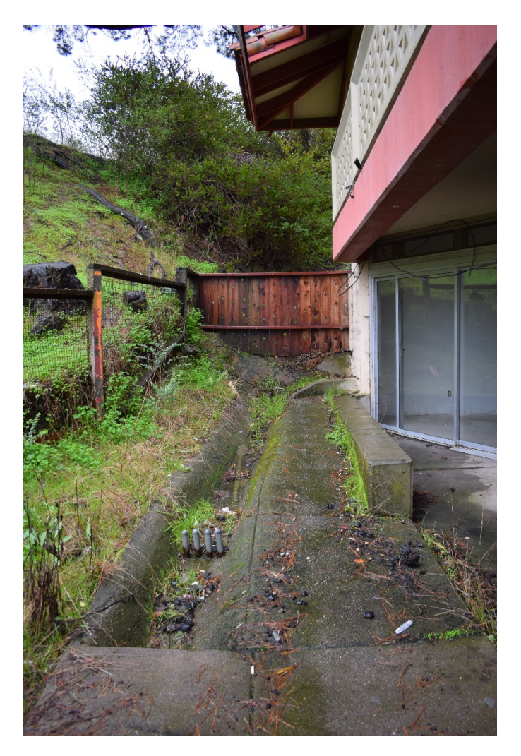
Figure 7: Photograph of the concrete ditch into which the proposed French drain would empty, and existing wood fence.

The length of the new drain would be concealed within the concrete floor of the ground level landing but would require a new strip of concrete to be installed over the drain. A change in the color of the concrete where the drain would be installed would be visible from limited locations adjacent to the south end of Building 49, at the east, west, and south facades, until it is weathered.