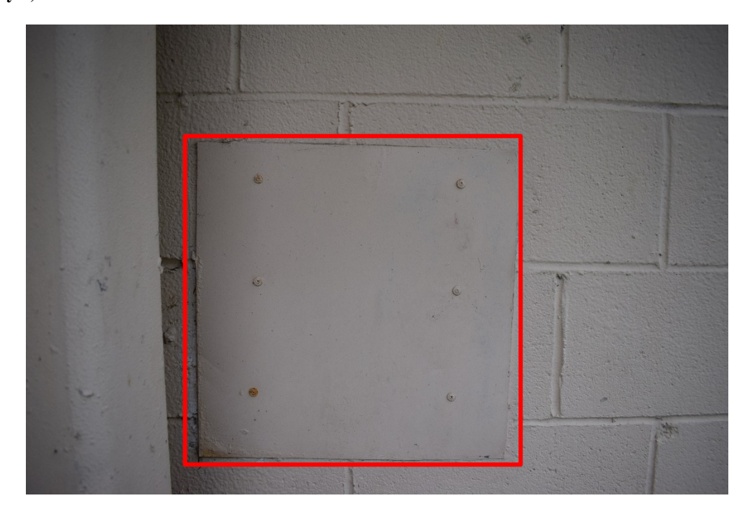
Figure 4: Close-up of the proposed insertion point of the French drain (outlined in red), located at the south end of the primary (west) façade of Building 49, facing east.