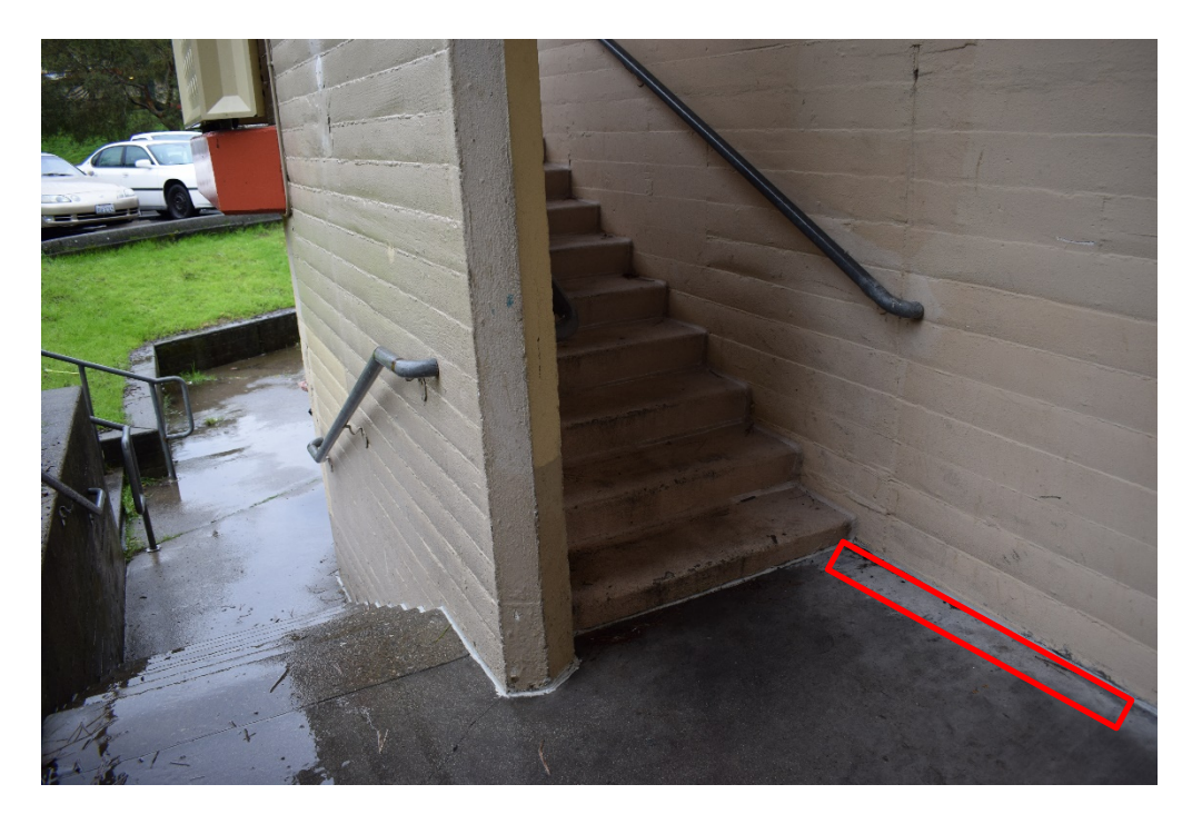
Figure 5: Photograph of the proposed French drain location (outlined in red), which would run under the existing stairway and up to the ground level landing, and continue east along the building's south façade, roughly within the area outlined in red.