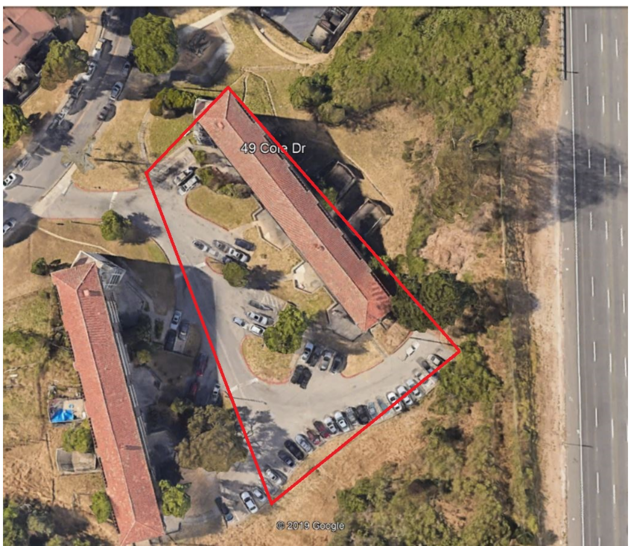
Figure 1: An aerial site plan illustration of the APE for the 6-inch French drain installation, shown in red. North is up, Highway 101 is to the east.

east, west, and south facades. Therefore, the APE for this undertaking is defined as the entire Building 49 footprint, and includes associated hardscaping features such as the building's pentagon terraces, parking terraces, and driveway to its west; the concrete ditch that runs along the building's east façade; and the additional parking to the south (Figure 1).