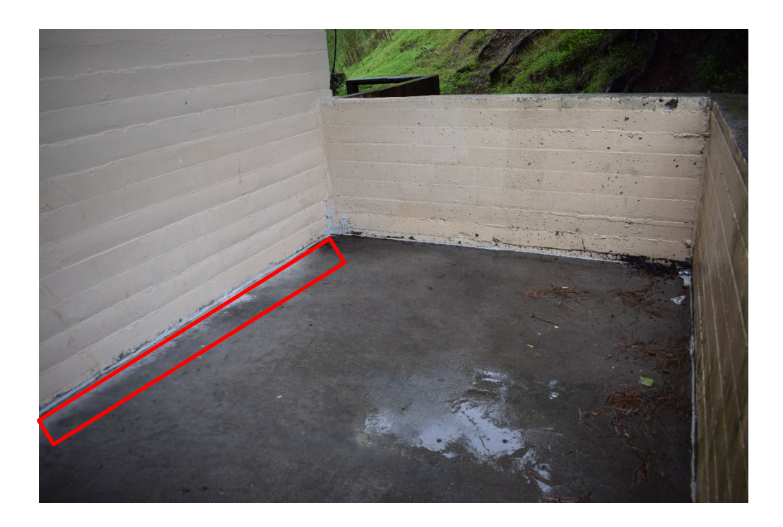
Figure 6: Photograph of the proposed French drain location (outlined in red), would be located within the ground level landing in the south stairway at Building 49.