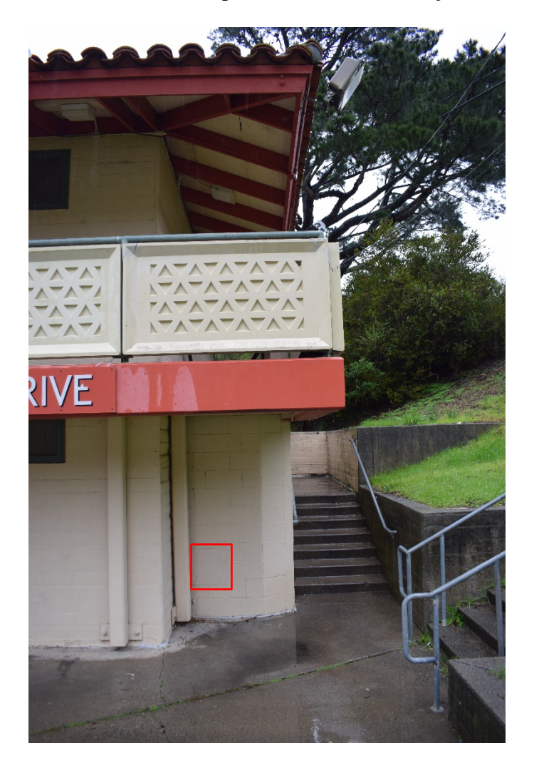
Figure 3: Photograph of the proposed insertion point of the French drain (outlined in red), located at the south end of the primary (west) façade of Building 49, facing east.

The French drain would be inserted into the south end of the primary (west) façade through an existing access point in the concrete that is presently covered by a square metal panel (Figures 3-4). From the access point, the new drain would be inserted under the stairway and would extend up to the ground level landing. It would run west to east, along the building's south façade within the concrete landing (Figures 5-6). The French drain would empty water through a weep hole in the east wall of the existing stairway into an existing concrete ditch located on the slope at the building's rear (east) façade (Figure 7). The concrete ditch would carry water from the French drain to the south, running parallel to Building 49's rear (east) façade. The existing concrete ditch runs below a wood fence that extends past the exterior rear façade of unit #15.