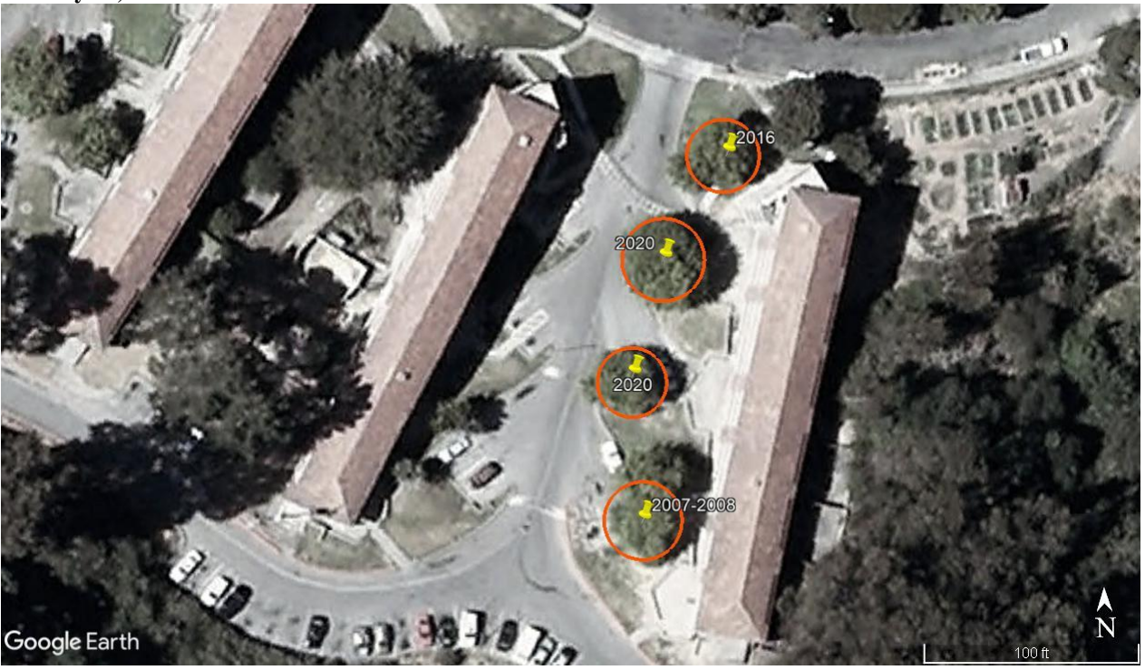
Figure 3. This 2007 historical aerial photograph depicts the location and removal dates of Chinese elm trees adjacent 69 Cole Drive.

With the removal of the two remaining Chinese elm in October 2020, the partial allée that once existed along the driveway has been lost.