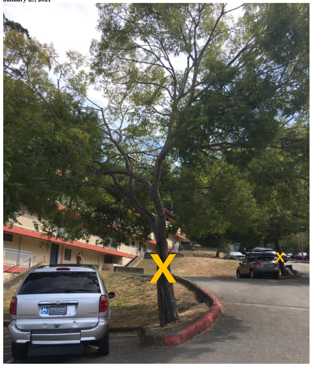
Figure 1. This figure depicts the Chinese elm trees prior to their removal by MHA. These trees are denoted by orange "X" marks.