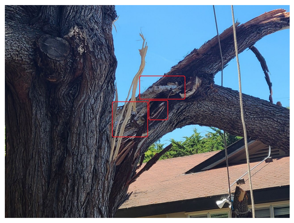
Photo 1 Evidence of white fungal growth in one of the rotted areas of the tree. Notations by ICF. 2023.