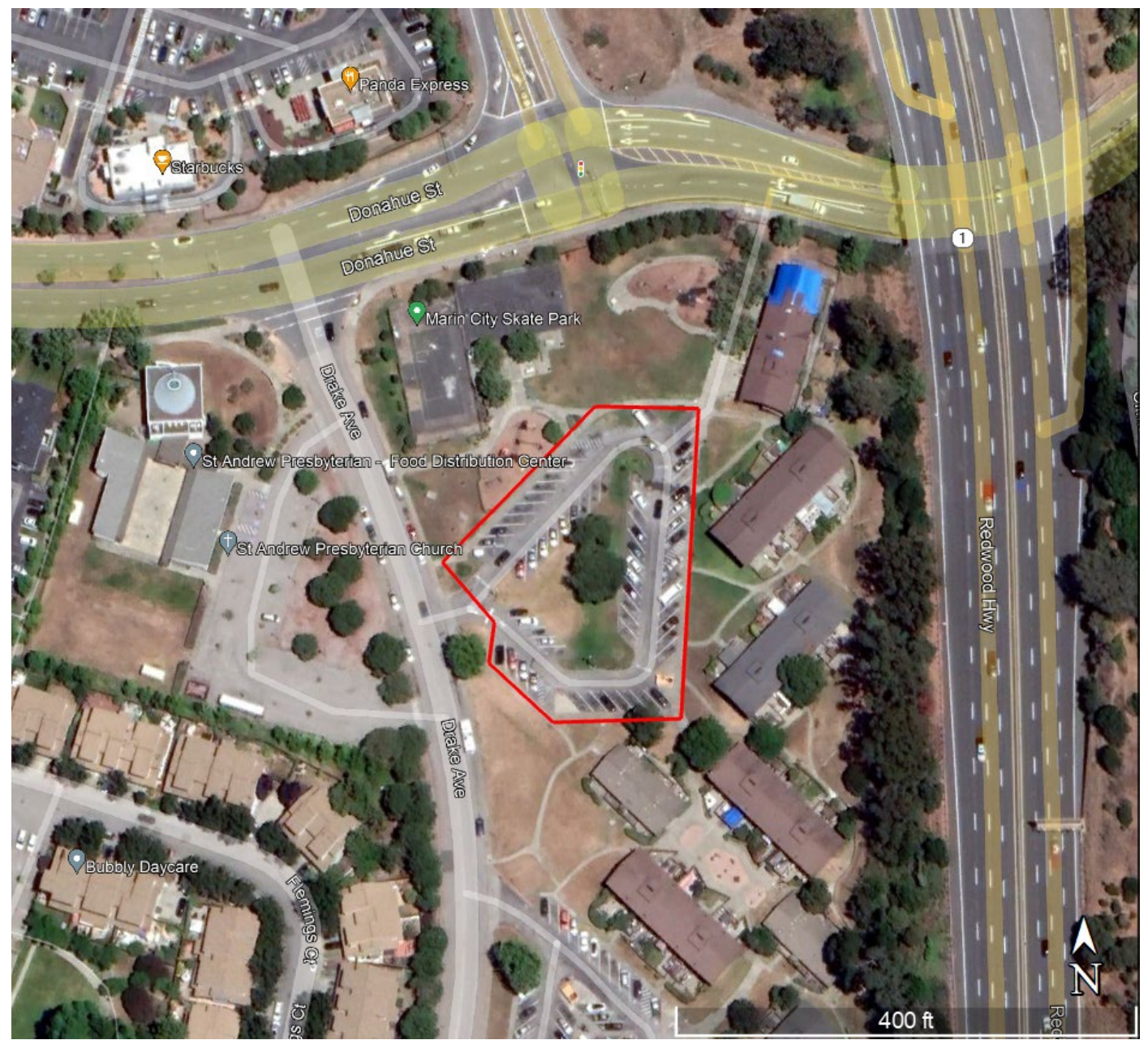
Figure 1 Proposed activity uses one "Staff" parking space at this parking lot for a period of approximately five weeks. Base Map: Google Earth 2022. Annotation by ICF 2022.