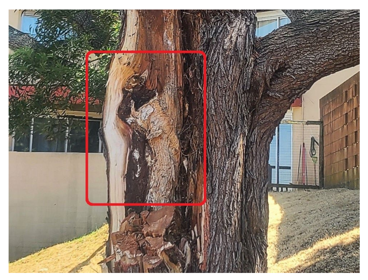
Photo 2 Evidence of white fungal growth along the broken segment of trunk of the tree after initial clearing of the limbs. Source: MHA, 2022. Notations by ICF. 2023.

To ensure public safety, MHA removed the black acacia tree. As of this FOE's writing, MHA has not yet proposed planting any replacement tree in the same location. The area was graded during the construction of Golden Gate Village and no archaeological resources were disturbed because of this undertaking.