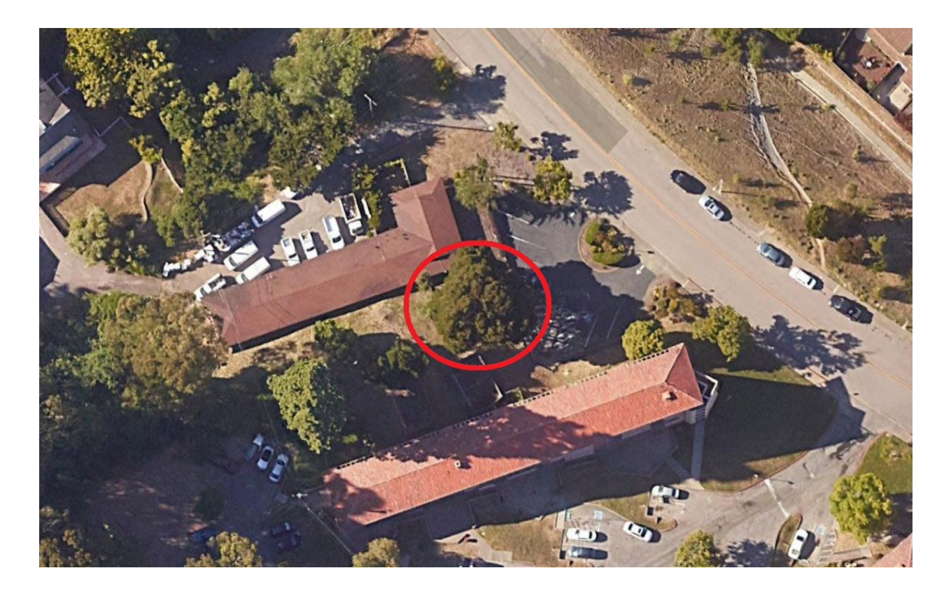
Figure 1. This figure depicts the location of the black acacia tree southeast of the Administration Building prior to its removal. Source: MHA, 2022. Notations by ICF. 2022.

Finding of Effect Memorandum October 27, 2022 Page 6 of 11