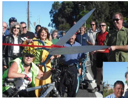
Above: Cutting the ribbon Right: Thanking County Department of Public Works for their excellent work on the project

This project is the culmination of a complex 3-year effort involving numerous stakeholders. It truly has been a collaborative effort of local government, the Marin County Bicycle Coalition, and the cooperation of the neighbors along Alameda del Prado that helped make the project reality. Thank you to everyone who helped make this project a success!