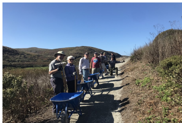
Above: Dennis among the Kehoe Beach Trail Volunteers