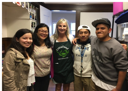
Photo of an Extra Food delivery to the nonprofit, Next Generation Scholars

Donations in the form of funds, food, and time are always appreciated. Please contact Marv Zauderer at (415) 997-9830 and Marv@ExtraFood.org .