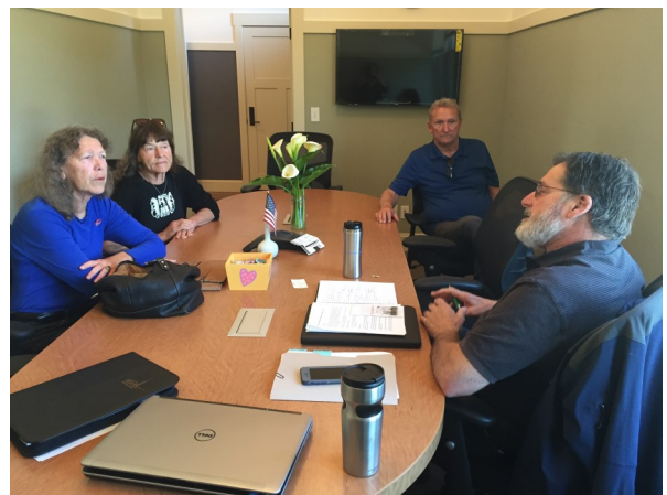
Meeting with constituents in Tomales

For more information visit www.alertmarin.org