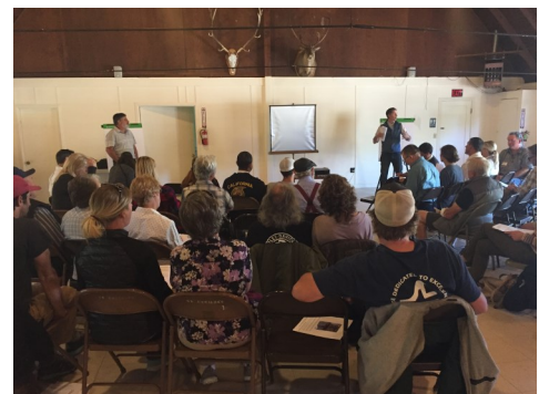
Speaking to attendees of our AG Roundtable