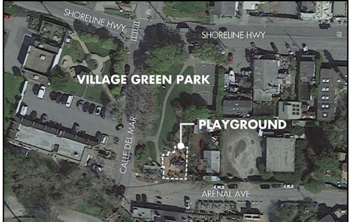
Village Green Park and Playground Renovation Project Area Google Earth image