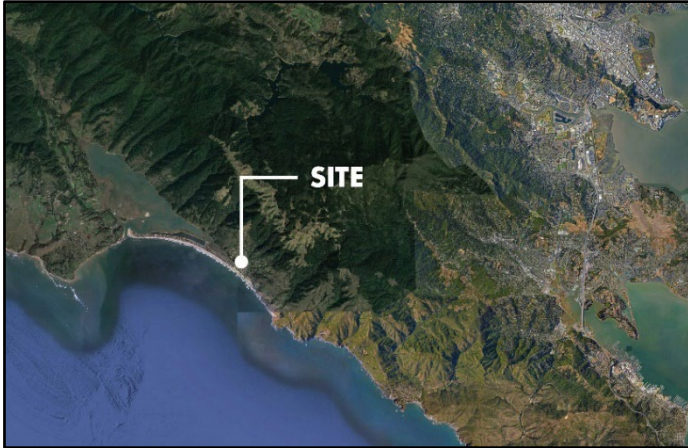
Project Vicinity Stinson Beach, CA