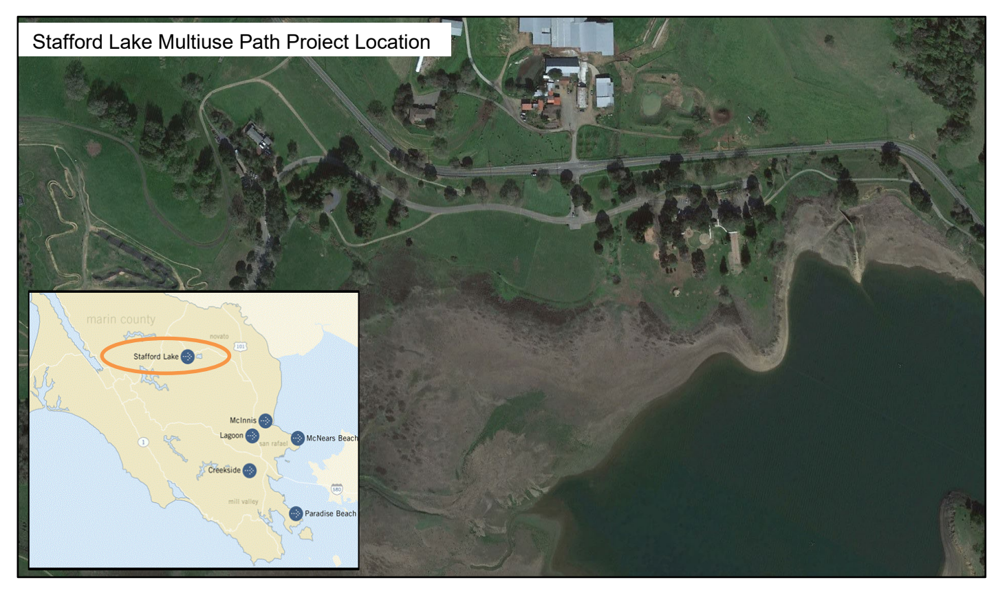
Proposed Multiuse Pathway (in red)