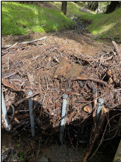
Damage Before Project