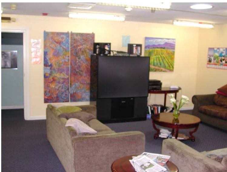
Helen Vine Sitting Room (March 2006)

A 2002 Marin County Civil Grand Jury report states, "The present location and condition of the Helen Vine Detox Center is vastly inadequate and inappropriate for a facility devoted to recovery from alcohol and substance abuse. It may even be unsafe."