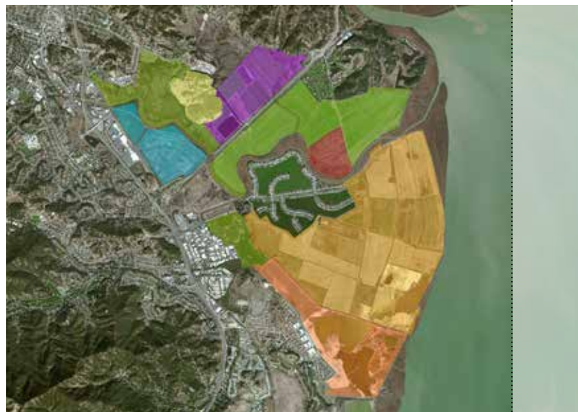
Colored areas indicate the various sections of the Novato Creek Baylands Vision. Bel Marin Keys is at the center.

Marin County has developed a modified version of the plan called the Novato Baylands Restoration Initiative. This initiative calls for the breaching of dikes and full tidal-marsh restoration of several basins that will increase tidal prism (the extent of daily tidal flows). These actions will improve channel scour to remove accumulated sediment without dredging and provide important habitat to several threatened and endangered species of concern. They will be carried out within current property-ownership boundaries. Adaptation to sea level rise is an important focus of the baylands restoration initiative.