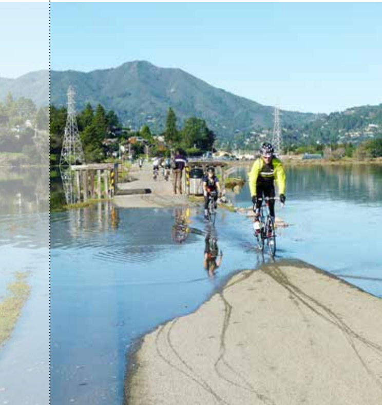
Mill Valley–Sausalito multiuse pathway at high tide.

This proposed project will evaluate the effectiveness of constructing coarse-grained beach edges at a number of locations in the Richardson Bay and Corte Madera Creek watersheds. The unique geology and geography of Marin County, with its steep bluffs and historic beaches, supported by the green progressive culture of its citizens and politicians, makes the eastern shoreline of Marin County an ideal location for construction and monitoring for these types of projects.