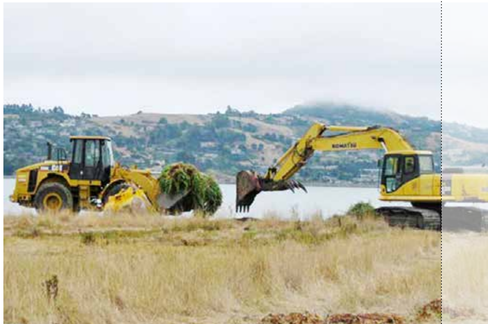
Heavy equipment removing the top layer of weedy vegetation on Aramburu Island.