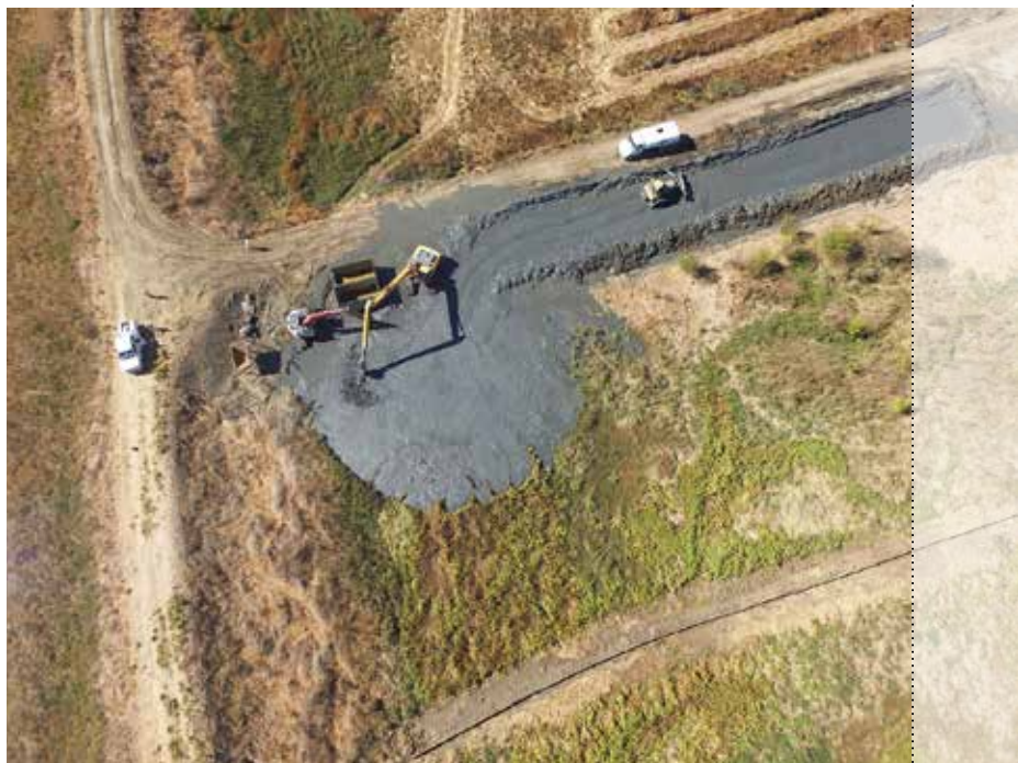
Equipment placing the dredged sediment into the ecotone area.