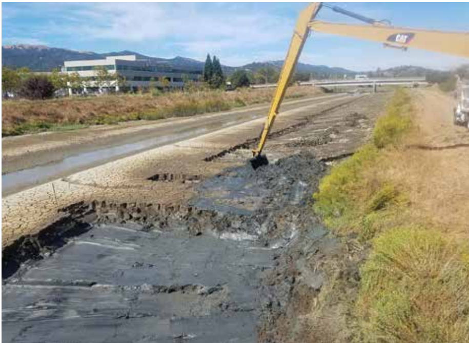
Dredging Novato Creek