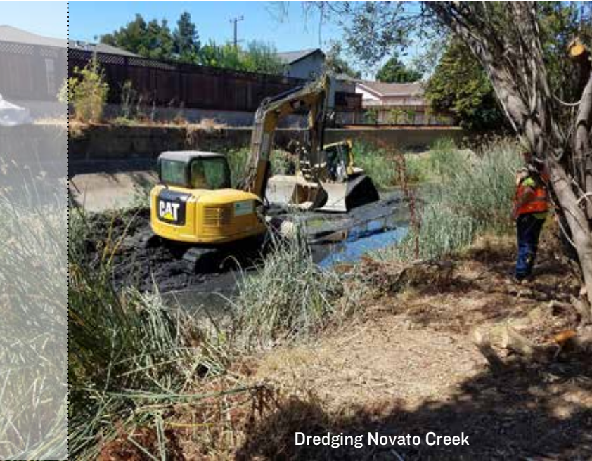
Dredging Novato Creek

In 2016, Marin County Flood Control and Water Conservation District staff took the initiative and proposed the beneficial reuse of dredging sediment from Novato Creek. The proposal requested that the regulatory and permitting agencies allow placement of the dredged sediment from the Novato Creek watershed at the edge of the former Deer Basin marshlands for use in the construction of future sea level rise levees. Additionally, they requested that they not be required to mitigate for the impacts of this placement.