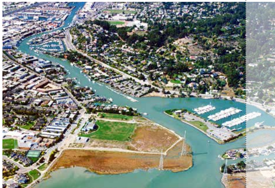
Canal area of San Rafael

A series of meetings lasting several hours could be held with clearly identified milestones to reach. County staff,