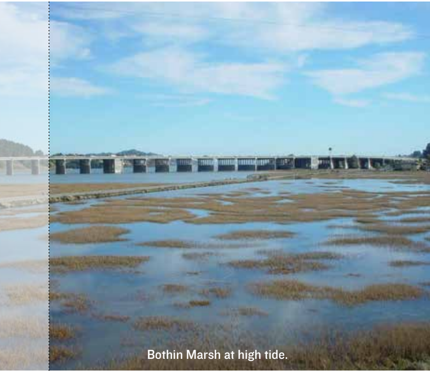
Bothin Marsh at high tide.

Part of Richardson Bay presents ideal conditions to conduct a feasibility study of the costs, impacts, and effectiveness of reusing dredge sediments. These could be taken from Coyote Creek in Tamalpais Valley to enhance habitat in the adjacent Bothin Marsh and prepare the marsh area to assist with sea level rise adaptation.