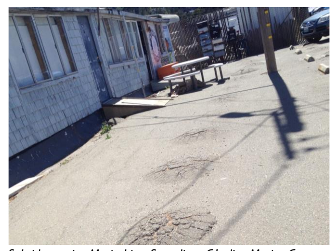
Subsidence in Marinship, Sausalito.