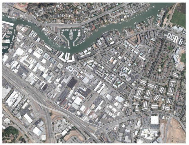
Canal neighborhood, San Rafael, is highly vulnerable to sea level rise.

Adding the storm surge alters this order with San Rafael still topping the list, with more than 2,000 flooded parcels, Santa Venetia following with more than 650 parcels, and Corte Madera with slightly less than 650 parcels. Flooded parcels account for nearly 40 percent of the residential parcels in Bel Marin Keys. Several hundred parcels are also vulnerable in Larkspur and Mill Valley. Also of note, Belvedere Lagoon area homes could be temporary flooded with saltwater during a storm surge event.