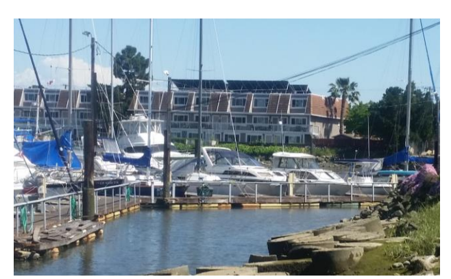
Marin Yacht Club, San Rafael.

By number of parcels, the top three impacted communities in long-term scenario 5 are: