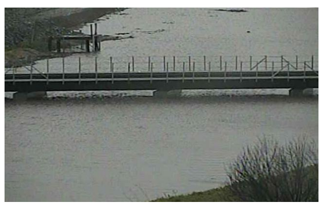
SMART Bridge, Novato.