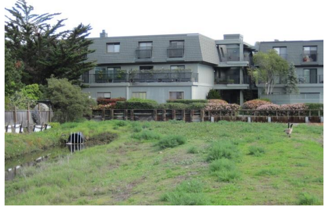
Condos along Saltworks Canal, Strawberry.

In scenario 6, by nearly a factor of nine, the majority of the storm flooded parcels consists of residential parcels, and amounts to 15 percent of all residential parcels in Marin County. In addition, while significantly fewer in number, the vulnerable commercial parcels are more than 40 percent of all commercial parcels in the County. More alarming is that more than 50 percent of industrial parcels could be impacted by flooding during a 100-year storm surge. The 1,149 commercial parcels hosting 2,180 businesses and 258 living units could be vulnerable by scenario 6, 60 inches of sea level rise and 100-yearstorm surge.