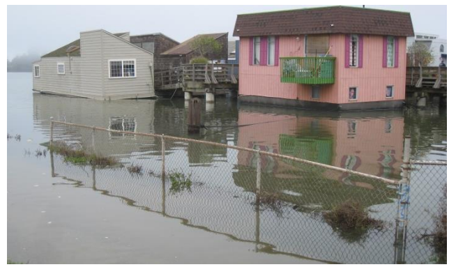
House boats. Waldo Point Harbor. Dec. 2014 king tide.