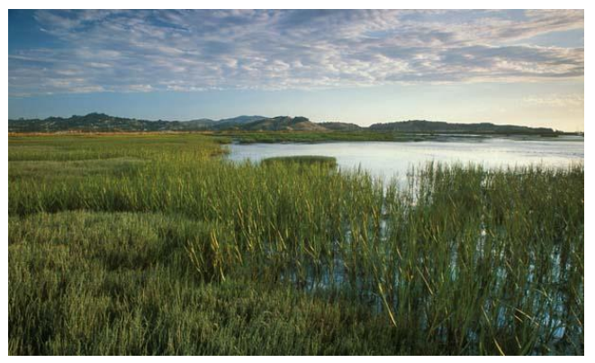
Corte Madera Ecological Reserve.