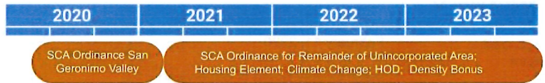
Figure 1: Project Timeline 2020 - 2023